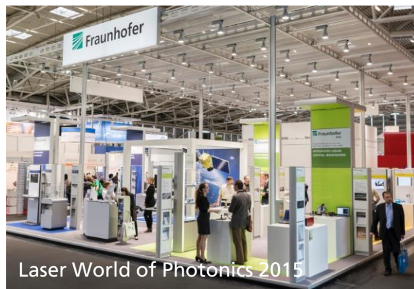
Figure 2: Fraunhofer Booth at Optatec 2014 (left) and Laser World of Photonics 2015 (right)

In the following section some facts of the three trade fairs have been collected to show the impact of the trade fair presentations for the dissemination of project results.